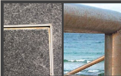
Photo showing 'Tea Staining' on Stainless Steel.

All you need is a nylon scourer, soapy water, and a little elbow grease to clean the surface.